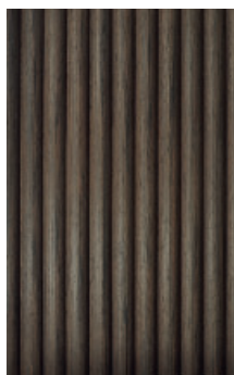
Oak choco FINELINE

The RIVA surface is available in three types of wood, as well as in MDF raw for your own colour coating. Optionally, the boards are also available with exclusive vintage lacquer in gold and silver.