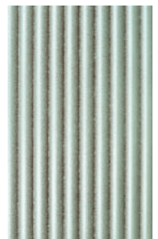
MDF Vintage Silver