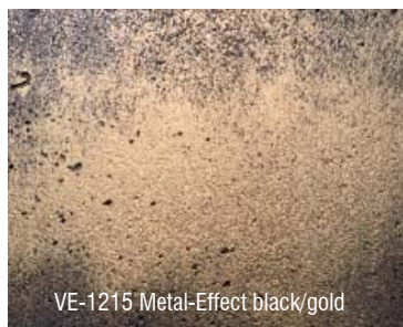
VE-1215 Metal-Effect black/gold