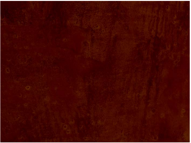
VR-1316 Rust smooth - with scratch-resistant PRO Surface