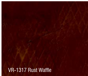
VR-1317 Rust Waffle