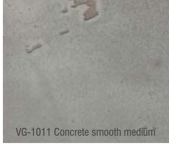
VG-1011 Concrete smooth medium