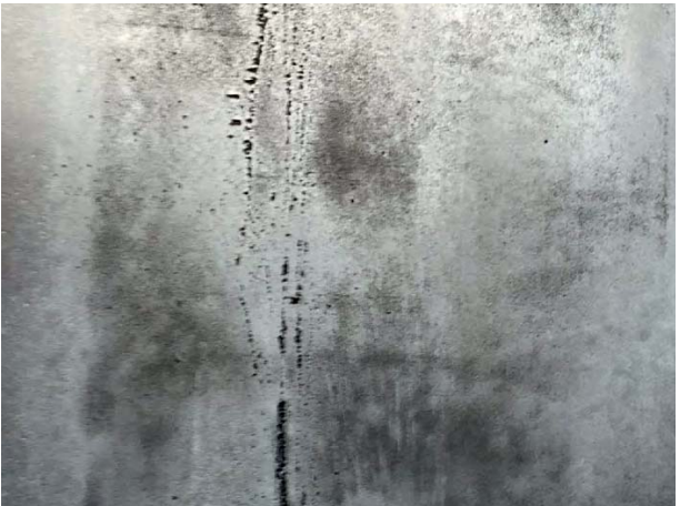
VE-1213 Metal-Effect black/silver