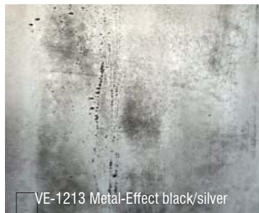
VE-1213 Metal-Effect black/silver