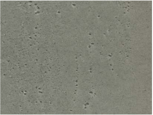
VG-1011 Concrete smooth, medium - with scratch-resistant PRO Surface