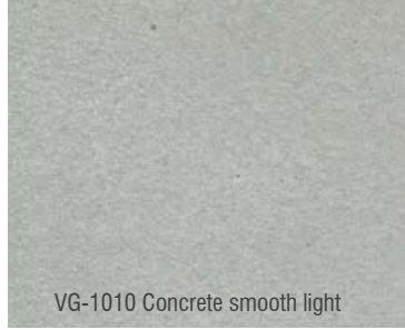
VG-1010 Concrete smooth light