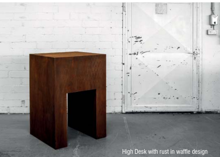
High Desk with rust in waffle design