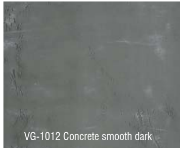
VG-1012 Concrete smooth dark