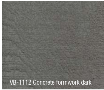
VB-1112 Concrete formwork dark