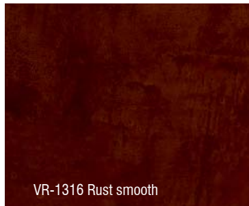
VR-1316 Rust smooth