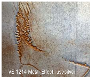
VE-1214 Metal-Effect rust/silver